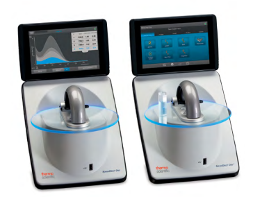
NanoDrop One/One<sup>c</sup> Improve sample confidence with contaminant identification and data integrity compliance