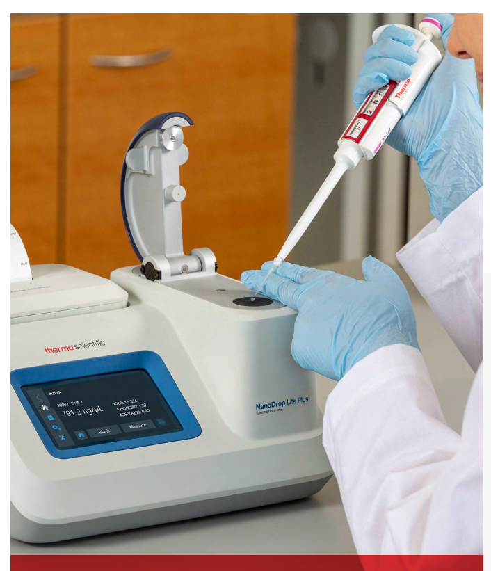
Simply pipette, measure, and clean!

The NanoDrop Lite Plus instrument is a valuable teaching tool and ideal for quality check measurements in busy research labs as well. The system measures purified DNA, RNA, and protein concentration up to 30 Abs and calculates critical A260/A280 and A260/A230 purity ratios. Our pioneering sample-retention technology eliminates the need to dilute highly concentrated samples making measurements easy. Simply pipette your sample directly onto the optical measurement pedestal, measure, and wipe clean. Built-in control simplifies operation, so even new users can quickly get results.