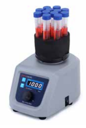
Basic Vortex Mixer shown with Tube Holder, 12 x 15mm. Tubes sold separately.