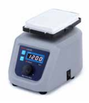
Basic Vortex Mixer shown with microplate. Microplate sold separately.