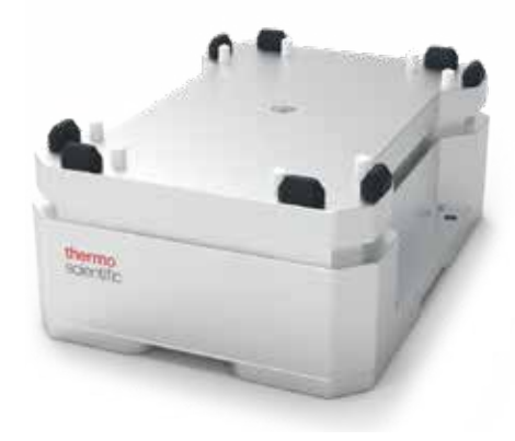
Teleshake 1536 Lift.