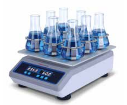
Digital Mini Rotator shown with Thermo Scientific Flask Clamp – set of 8 250mL clamps with flasks. Flasks sold separately.

Includes Universal Aluminum Platform (88882105). Multi-platform options available for loading vessels of all sizes. Warranty: 2 years | Certifications: cCSAus, CE